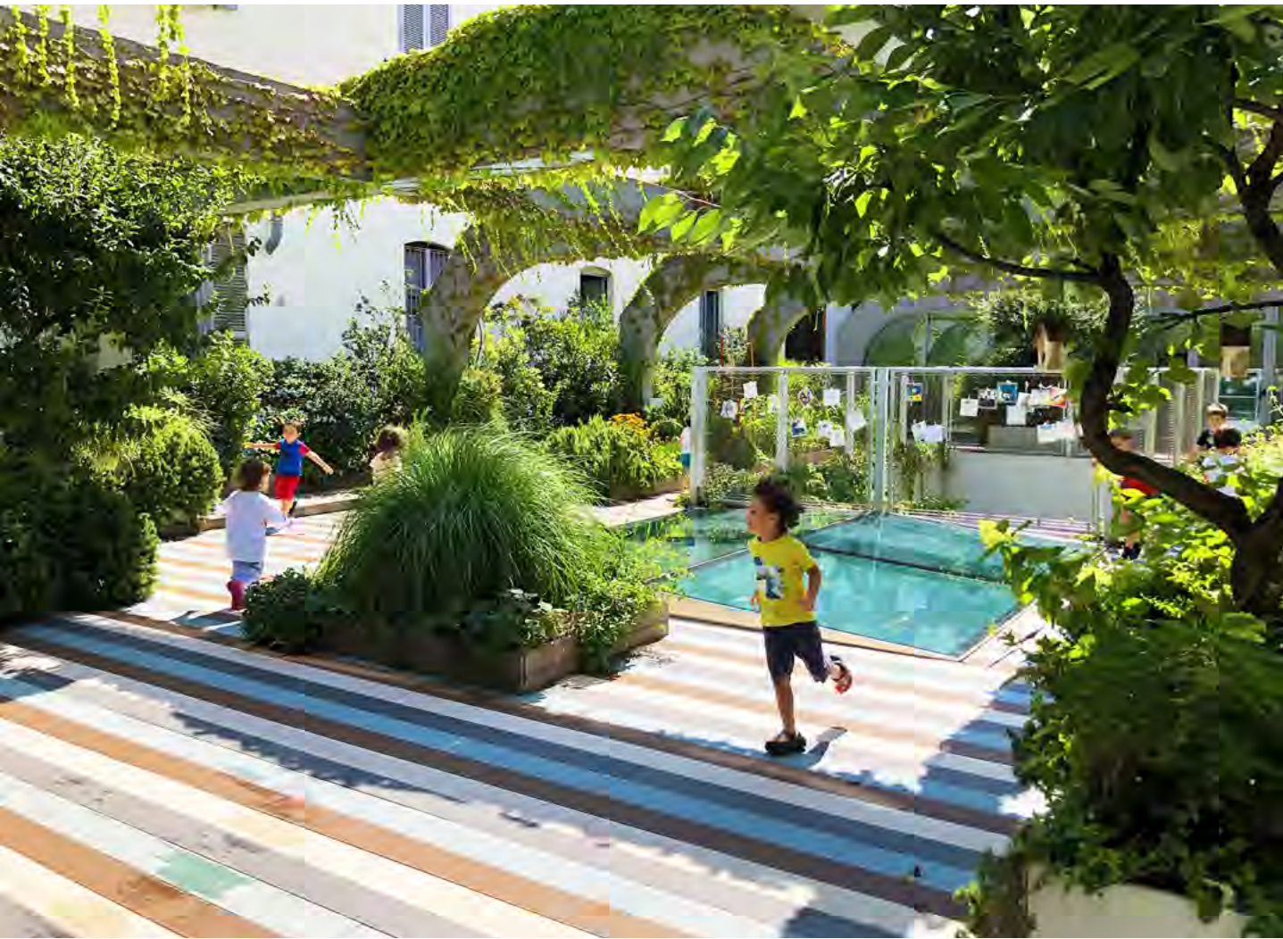
▲ ce with deliberate eclectic informality