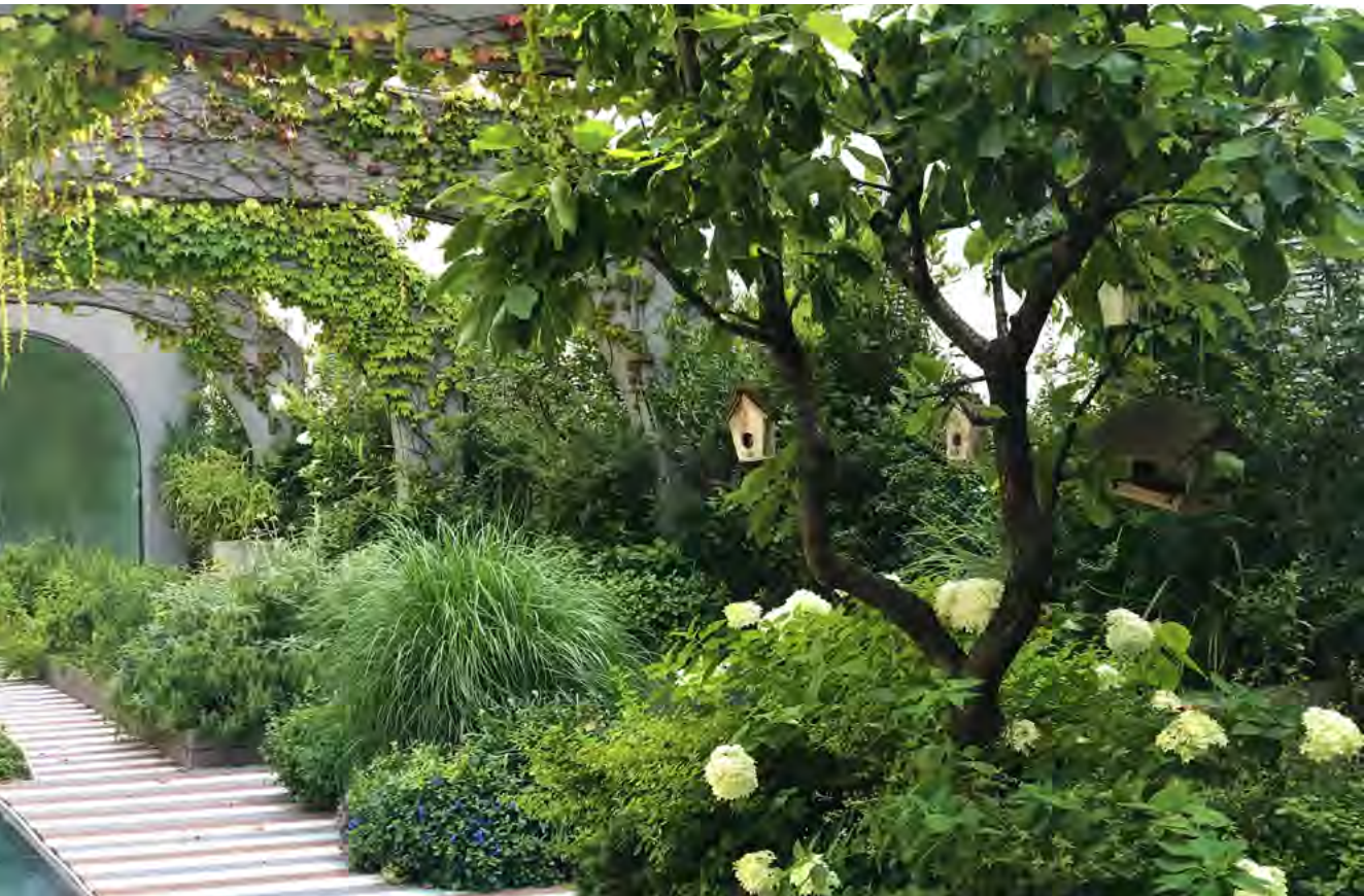
▼ ce with deliberate eclectic informality

Grasses show off their beautiful ears like firework, as they invite the children, to play and run between hedges in bloom.