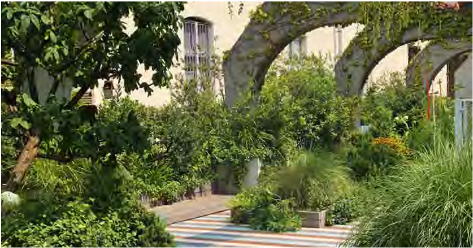
▼ ce with deliberate eclectic informality