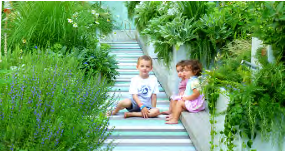
ce with deliberate eclectic informality ►