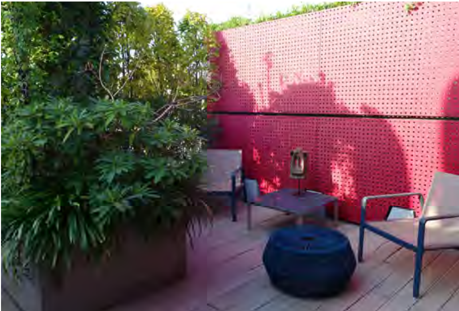
ce with deliberate eclectic informality ►