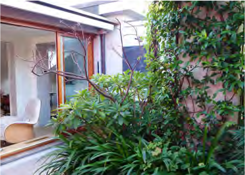
ce with deliberate eclectic informality