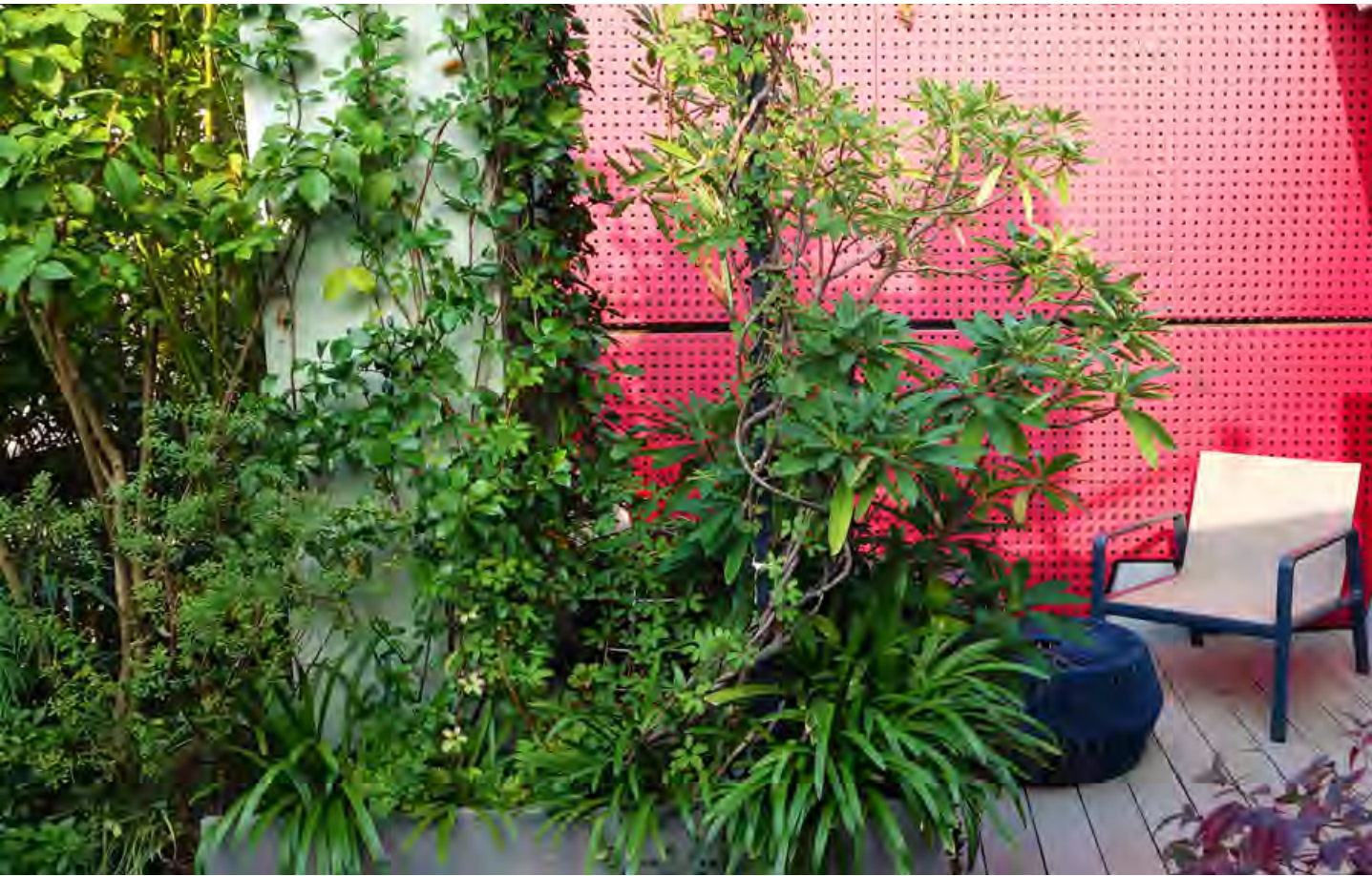
▲ ce with deliberate eclectic informality